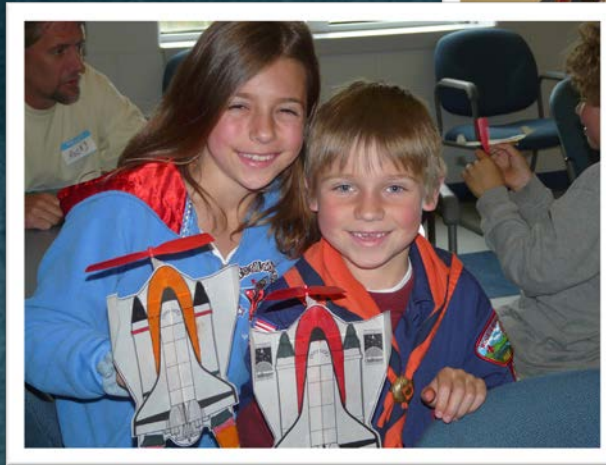
NASA Classroom of the Future, Wheeling Jesuit University