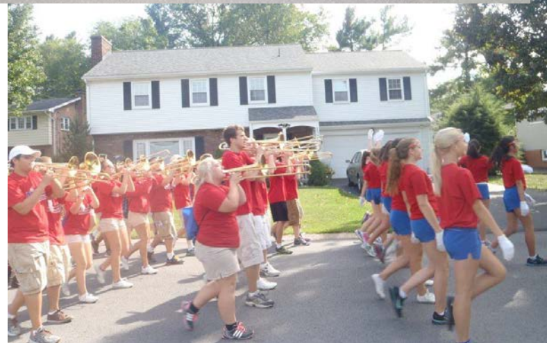
Marching down Colonial Drive